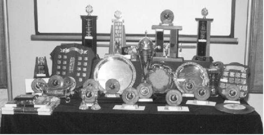
A display of the individual and perpetual trophies awarded at the Annual Presentation Night.

A series of generous benefactors over the years has provided the club with a most impressive array of handsome perpetual trophies to acknowledge the achievements of outstanding workers. After the Centenary celebrations, the committee reviewed the number of perpetual trophies that had been donated to the club by benefactors and decided that it should have a custom-built glass-fronted trophy cabinet in which the trophies could be housed and shown off to their full advantage. This has become a valuable and much admired asset to our clubrooms.